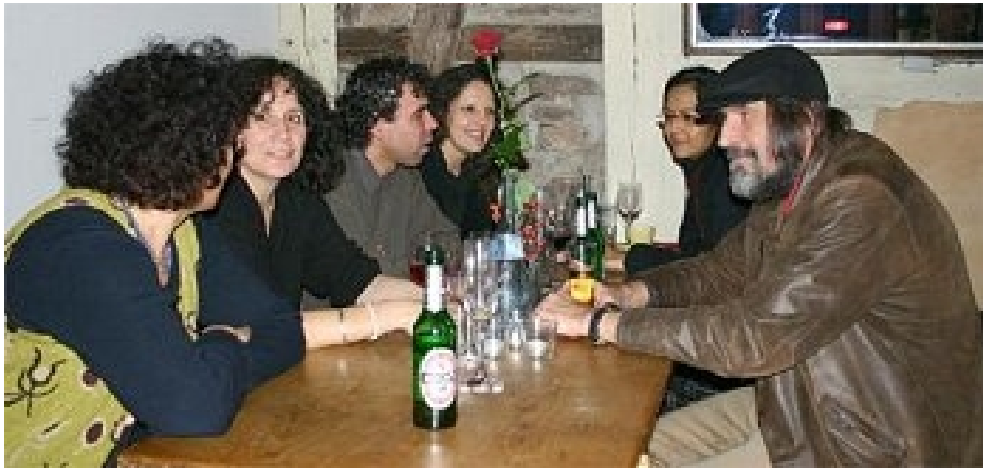
Representatives of the Spanish and Arabic Filmfestival and the One-World-Center in Tuebingen at another "regulars"- table