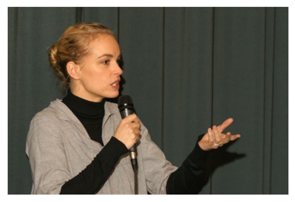
After the movie there is a lively discussion with the audience. First she has to explain some situations of the movie -