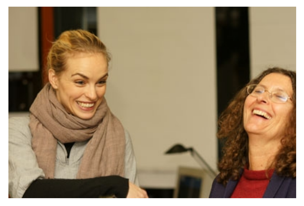
...Work can also be fun...

have another theme in common: their engagement for the environment.