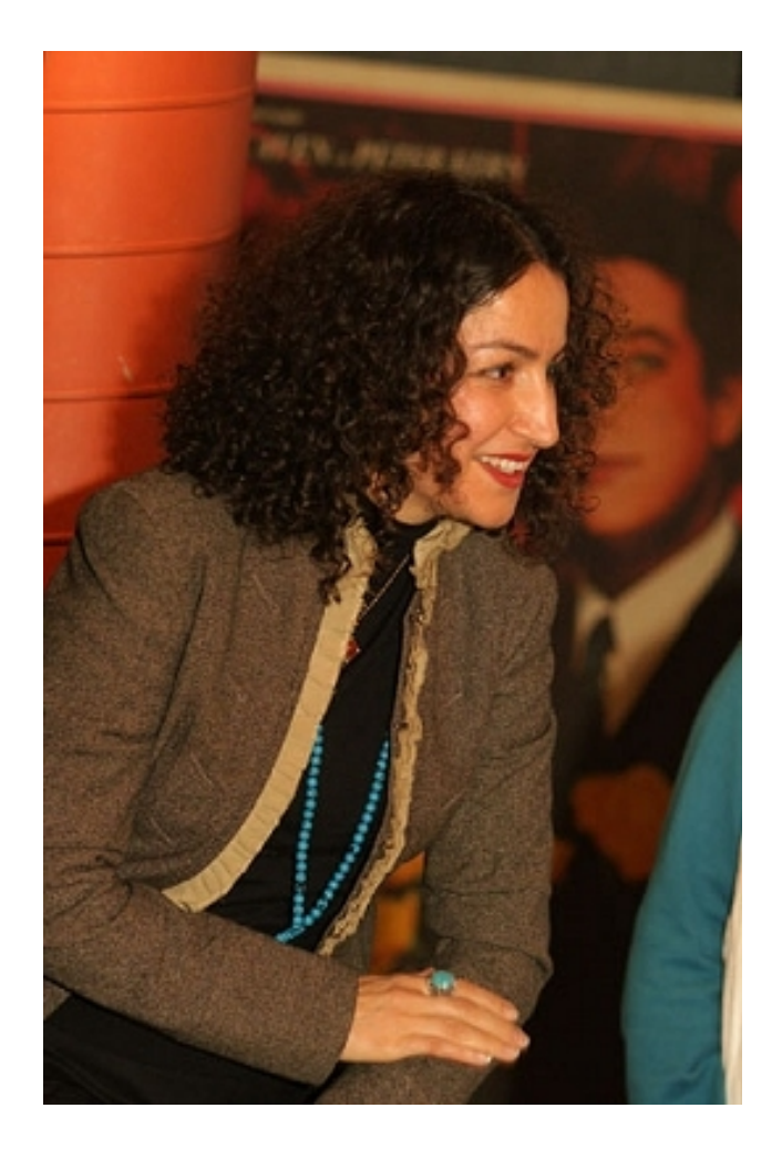
...which she answers with visible enthusiasm.