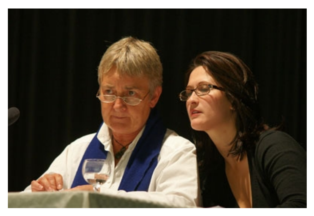
The next question is translated by Ajkuna Hoppe...