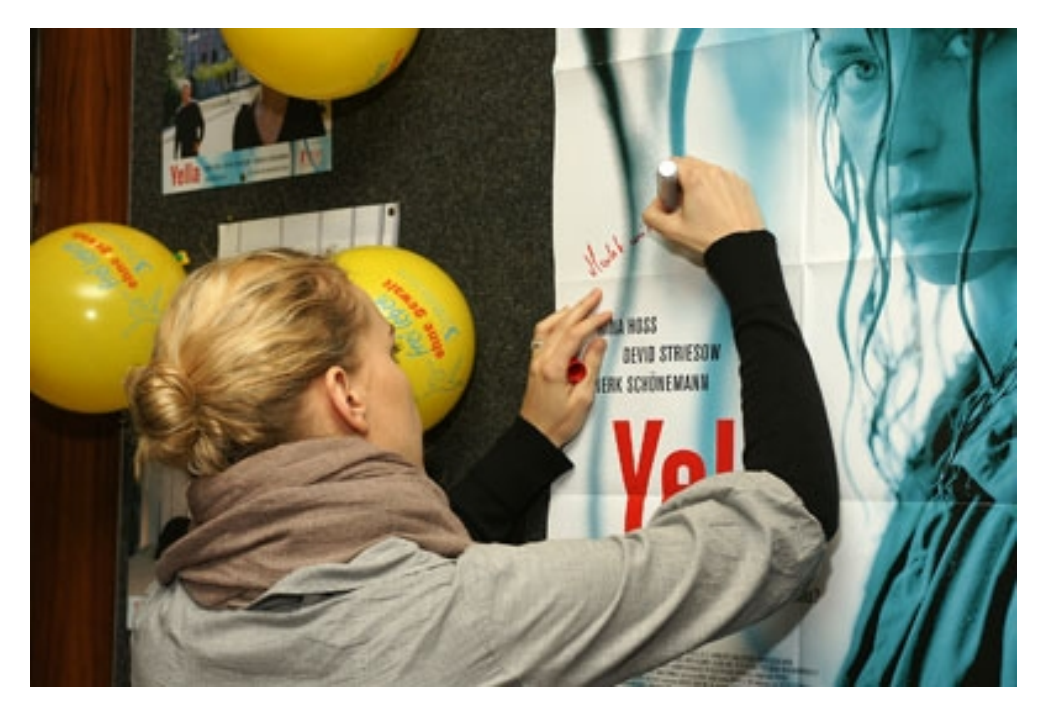
Nina's Praise for TERRE DES FEMMES: "Keep up the good work!"...