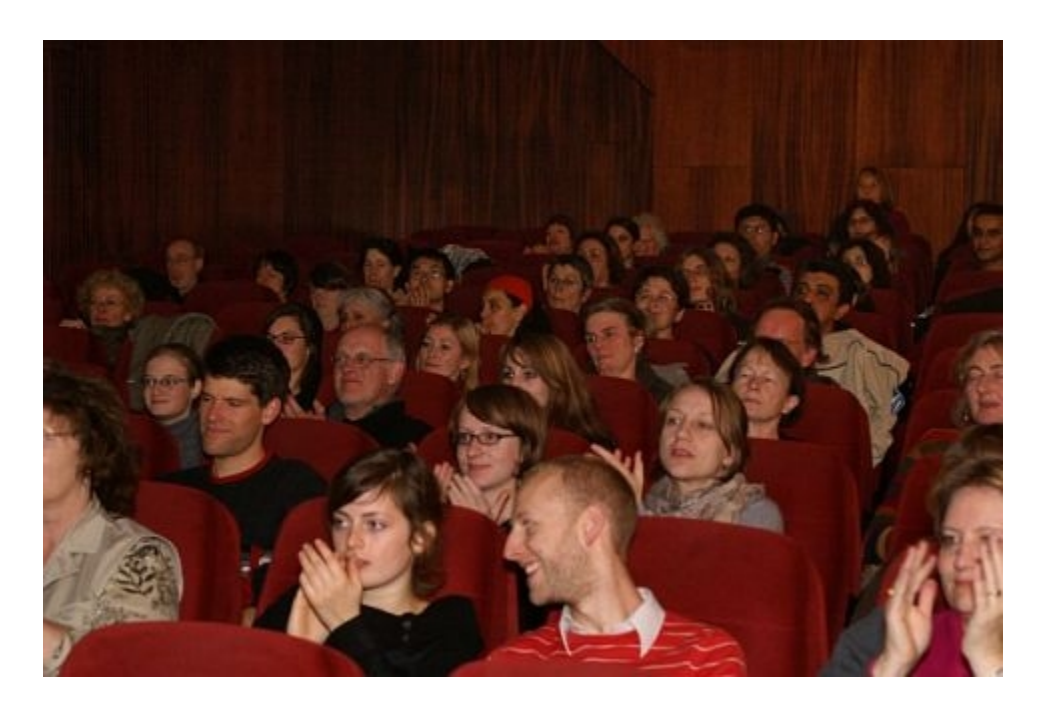
The audience was especially fascinated...