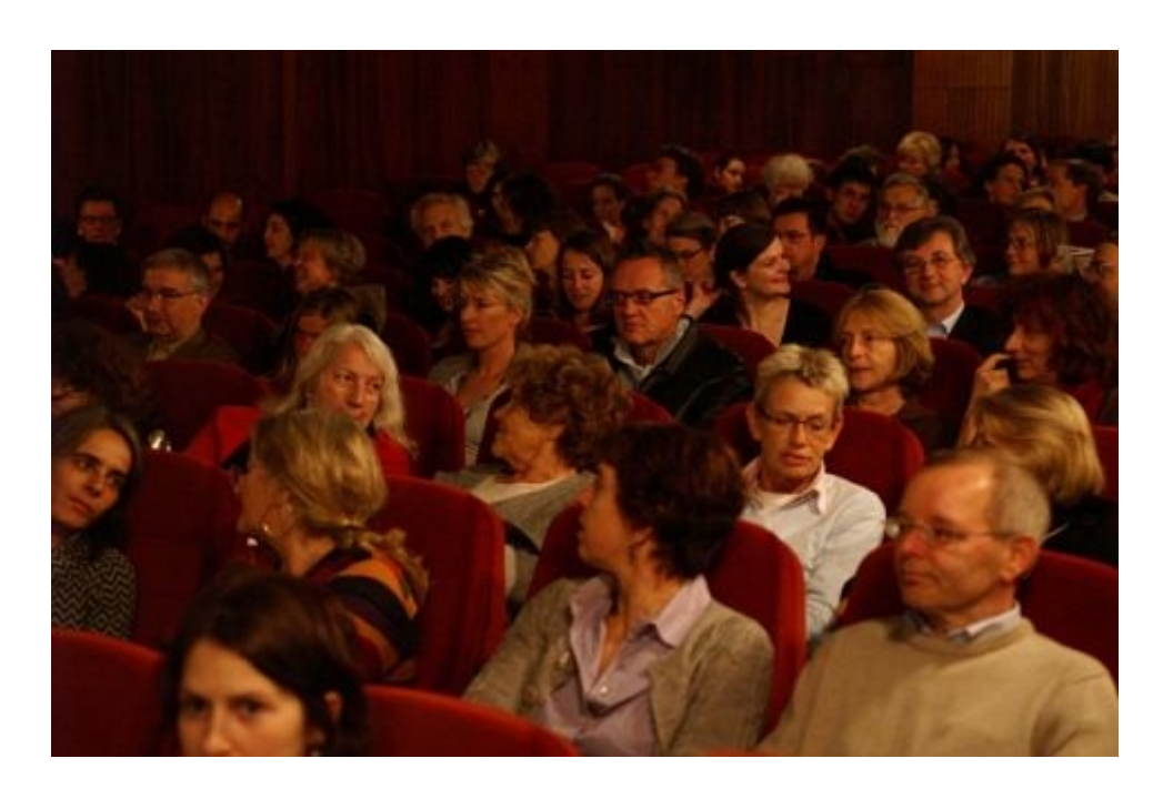
An eagerly awaiting audience looks forward to the eventful week...