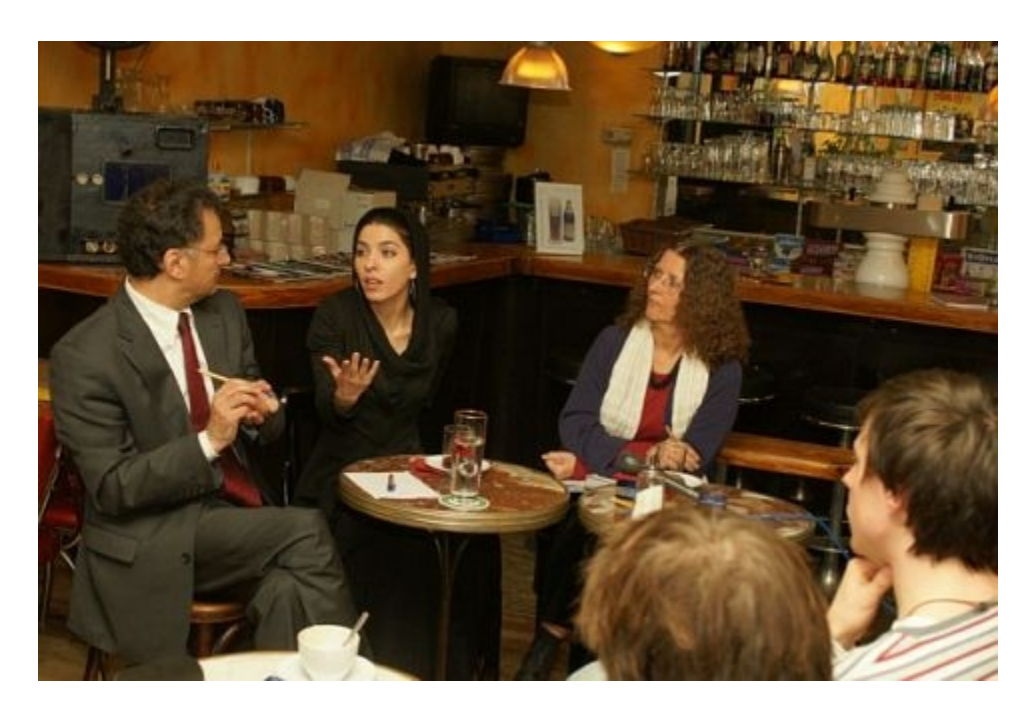
... there was a genuine exchange of ideas among the participants, way beyond the common question & answer game..."