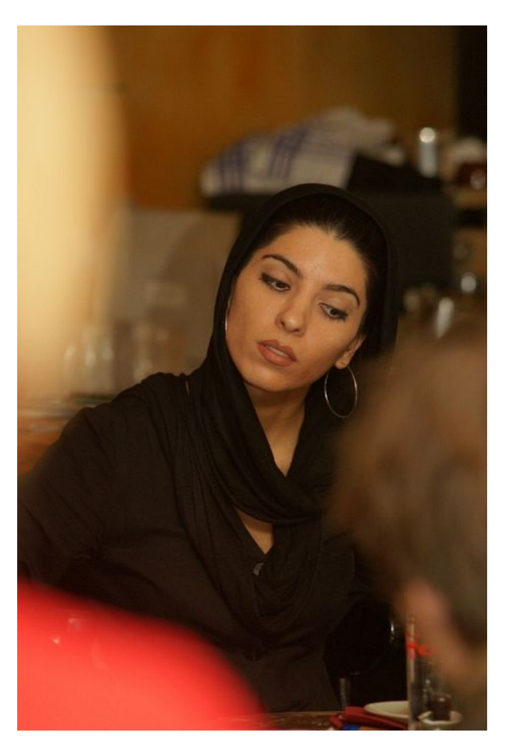
...and we all benefited from this."