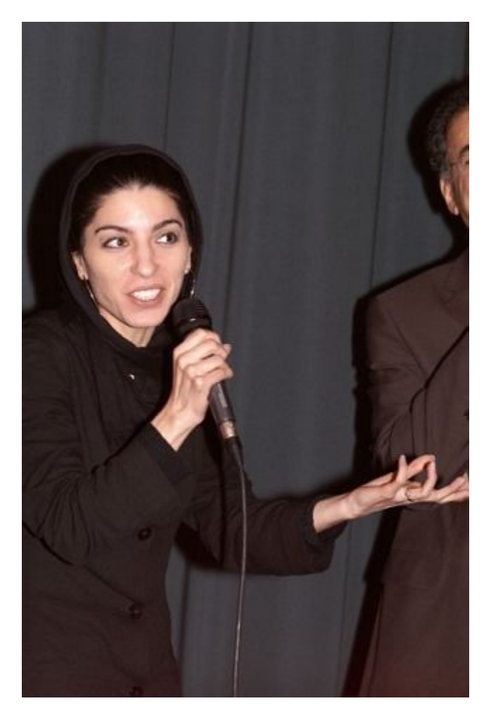
... by the looks behind the scenes revealed through various "Makings of..."