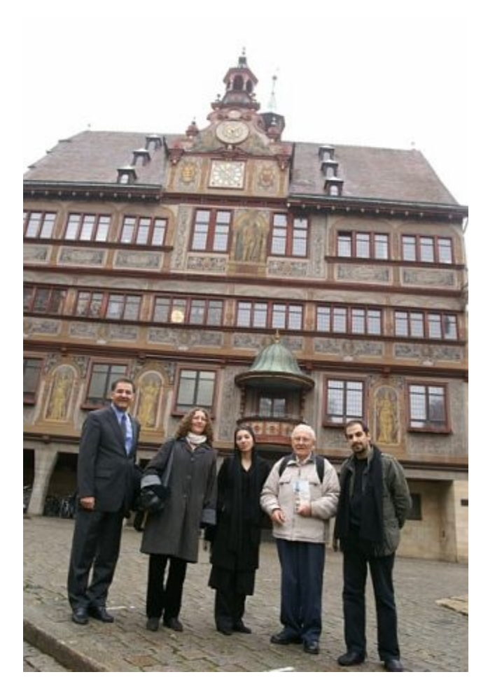
... joined for five days...