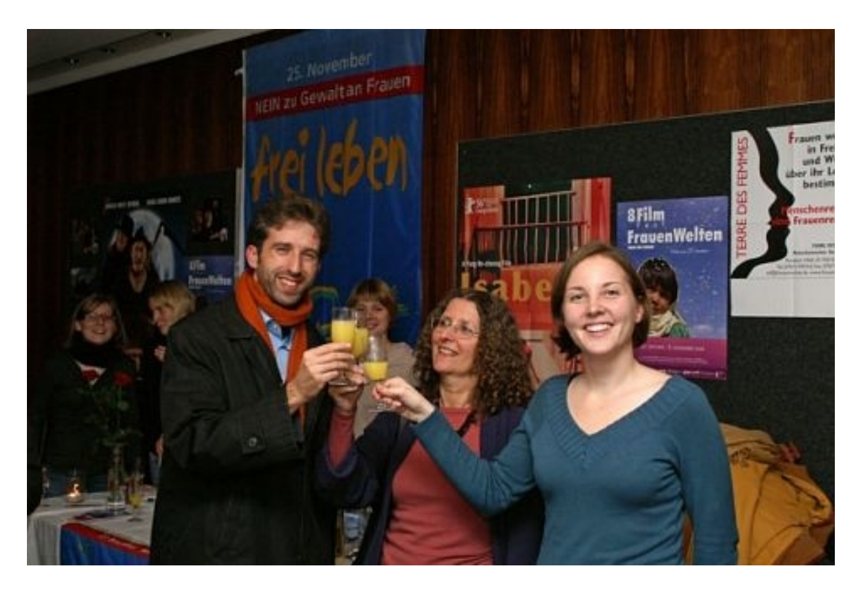
and also mayor Boris Palmer is embraced to joyfully clinking glasses....