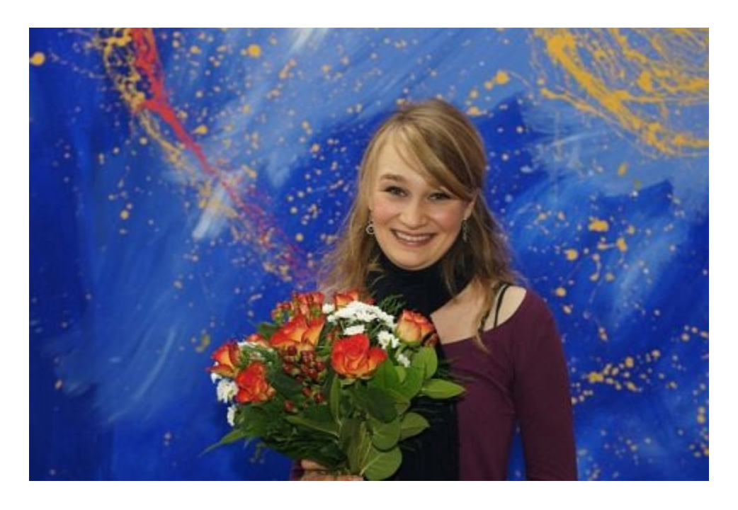
... and as from Women's Worlds, we admire her too!