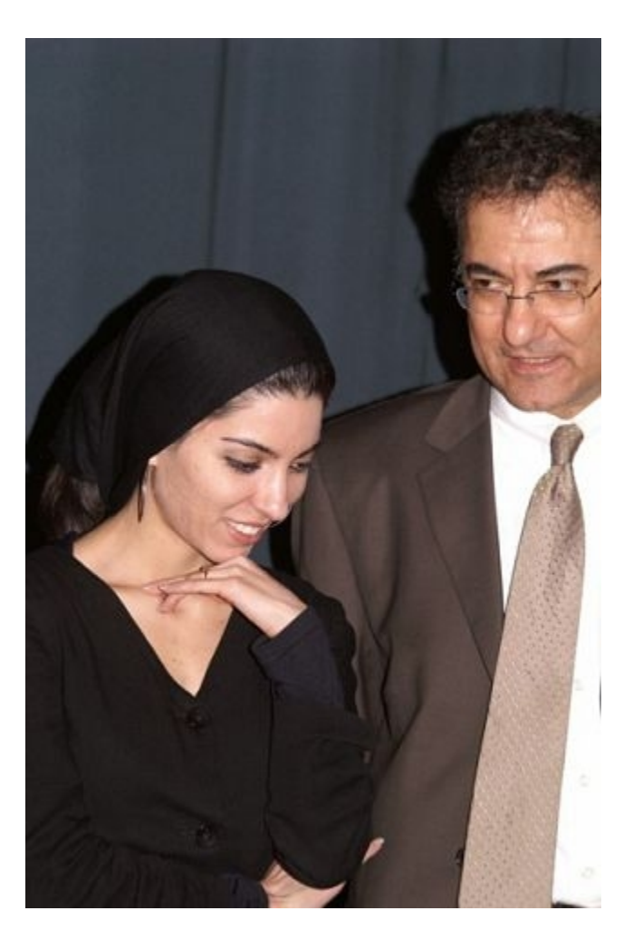
...and conducted insightful and exhilarating discussions with the audience.