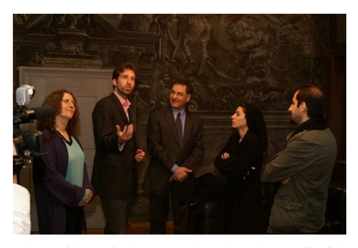
Lord Mayor of the City of Tuebingen Boris Palmer welcomed Samira Makhmalbaf...

... where she engages energetically and intensively with the amateur actors. Here Samira is shown during the shooting for her newest movie "Two Legged Horse", which was interrupted by a bomb attack.