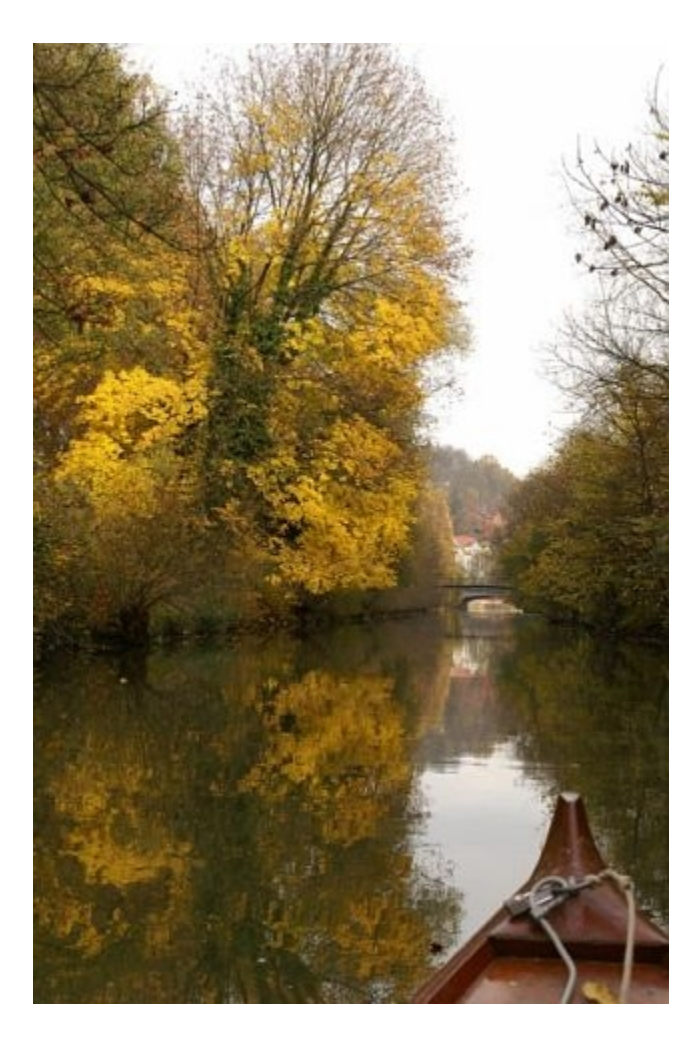
In between hard work, some moments of relaxation are necessary...