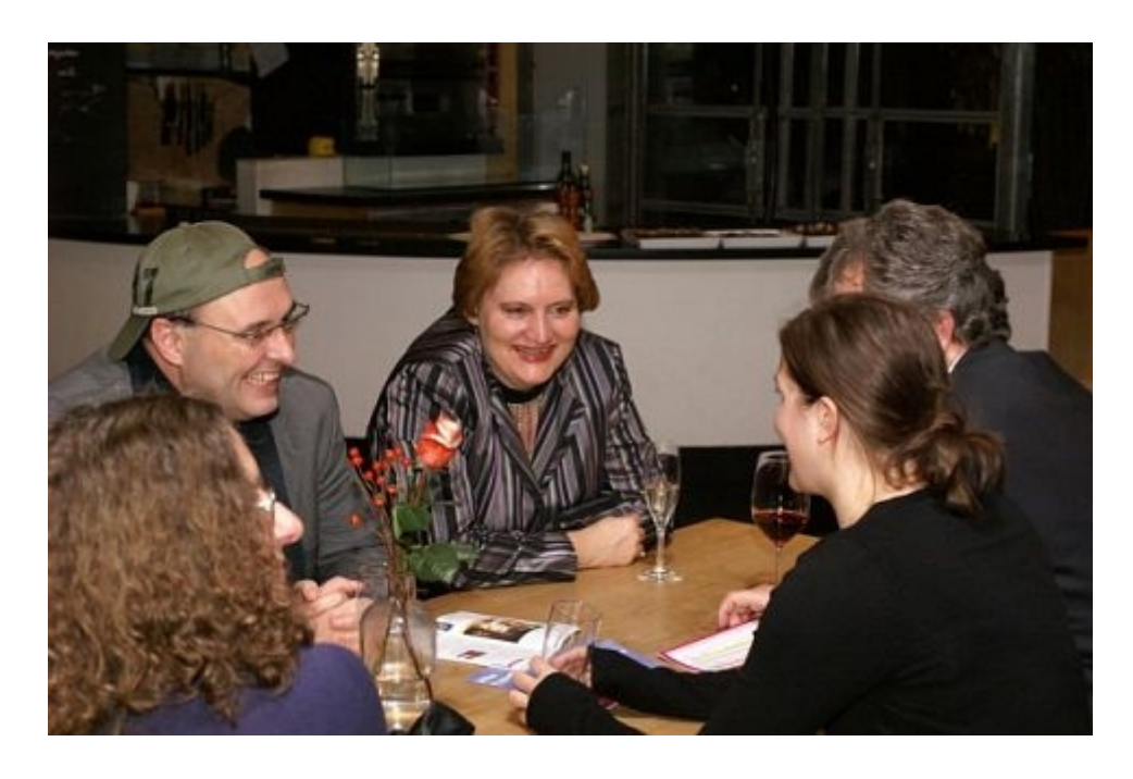
As always after the opening ceremony, there is time for extensive talk at the Kelter restaurant....