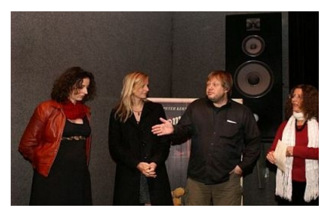
The filmmakers agreed about the eye opening perspective and stimulation coming in an exemplary way from the slums of the Third World. Perspectives that are neither sufficiently perceived in the German public discourse, nor insistently embraced by the responsible authorities.