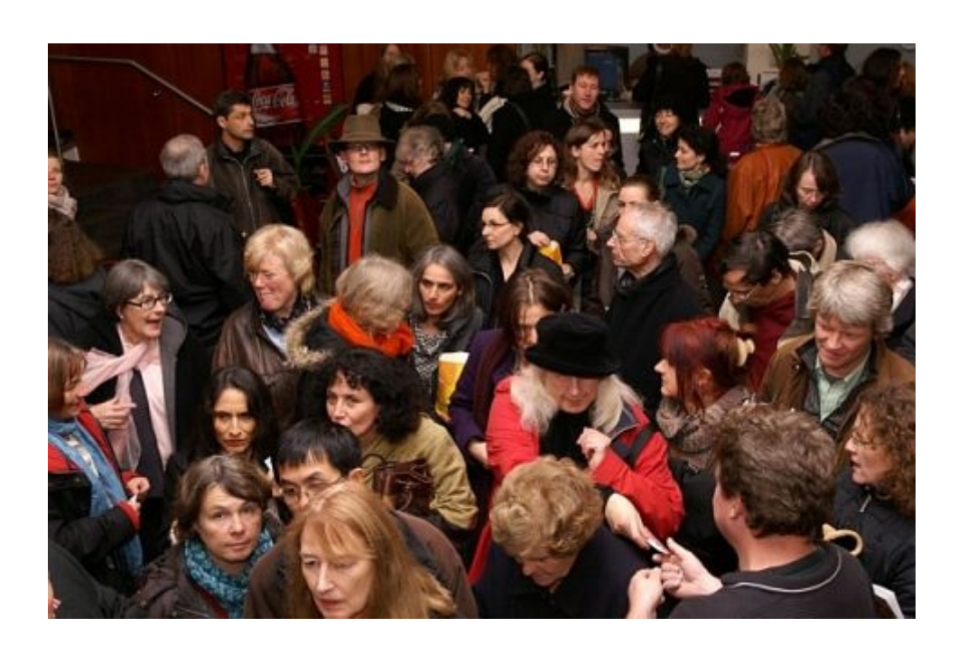
\ldots that in an instant fills the Museum-Foyer