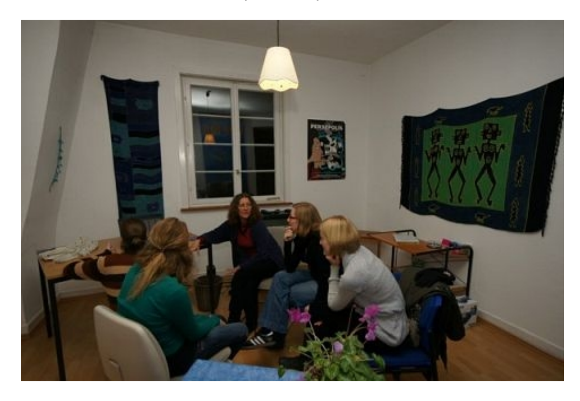
And here comes the last farewell:...