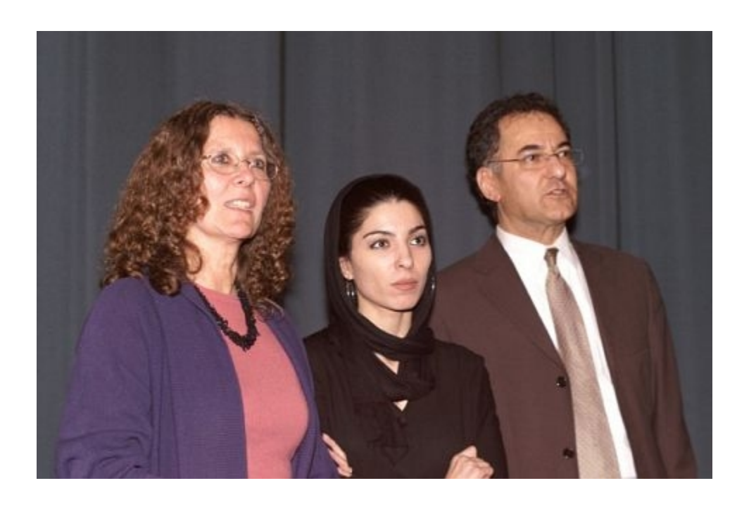
... presented at this years Film Festival a showcase of her movies, documentaries about her film making...