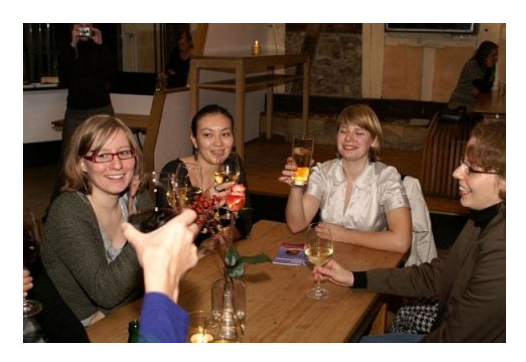
and at the TERRE DES FEMMES-Filmfest- team table glasses are raised to toast a successful Film festival course.