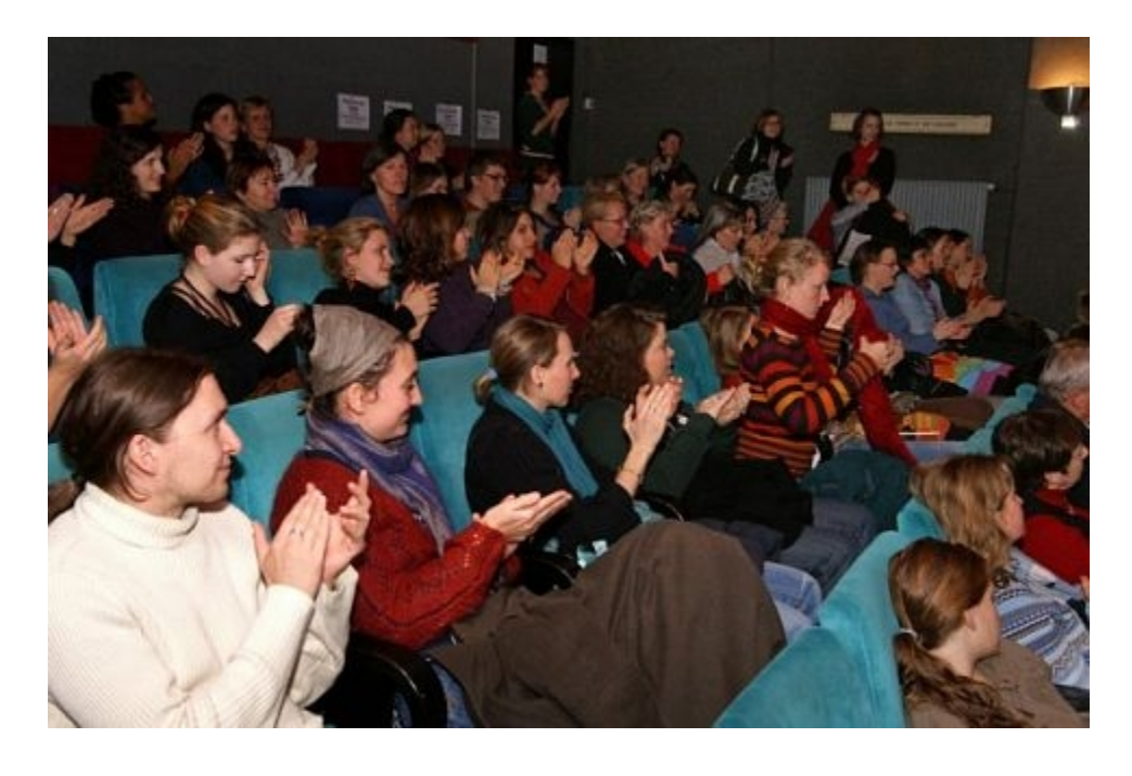
... in front of a deeply moved audience...