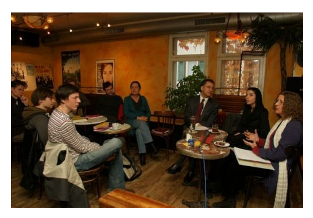
During a Workshop with filmmakers, film students and women rights activists at Cinema Arsenal...