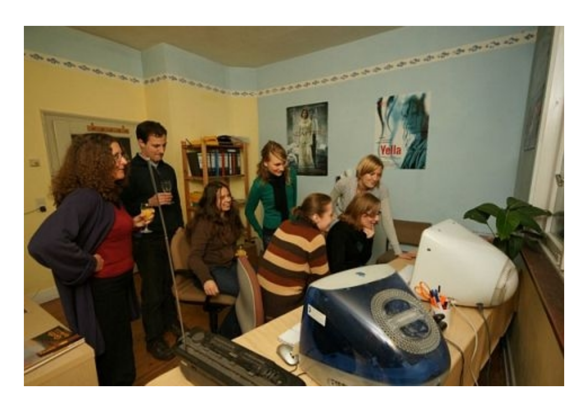
...that was provided for this years Women's Worlds by the City of Tuebingen in the ancient Center of the University Town.