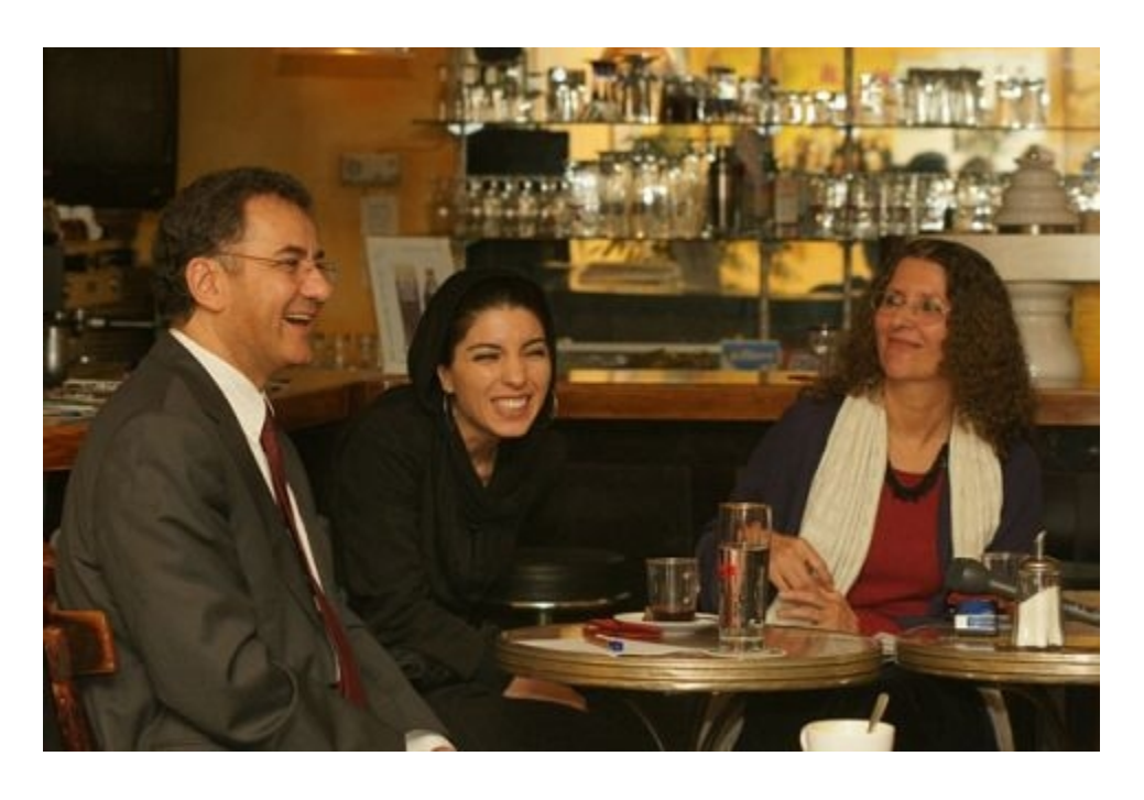
\dots Not to mention the funny side of the Workshop!