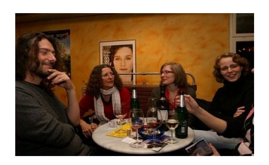
... and the Filmfest team.