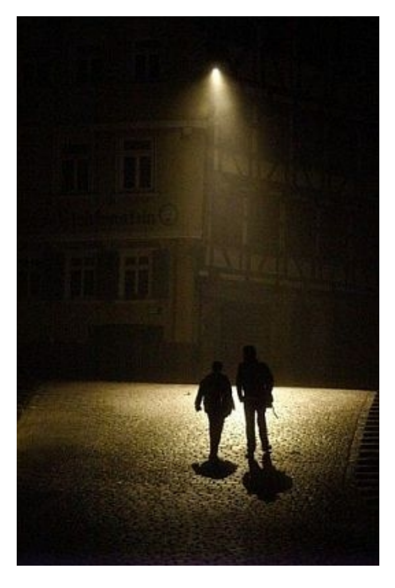
\dots and still later through the dimly lit historical marketplace up to Hotel am Schloß Tuebingen.