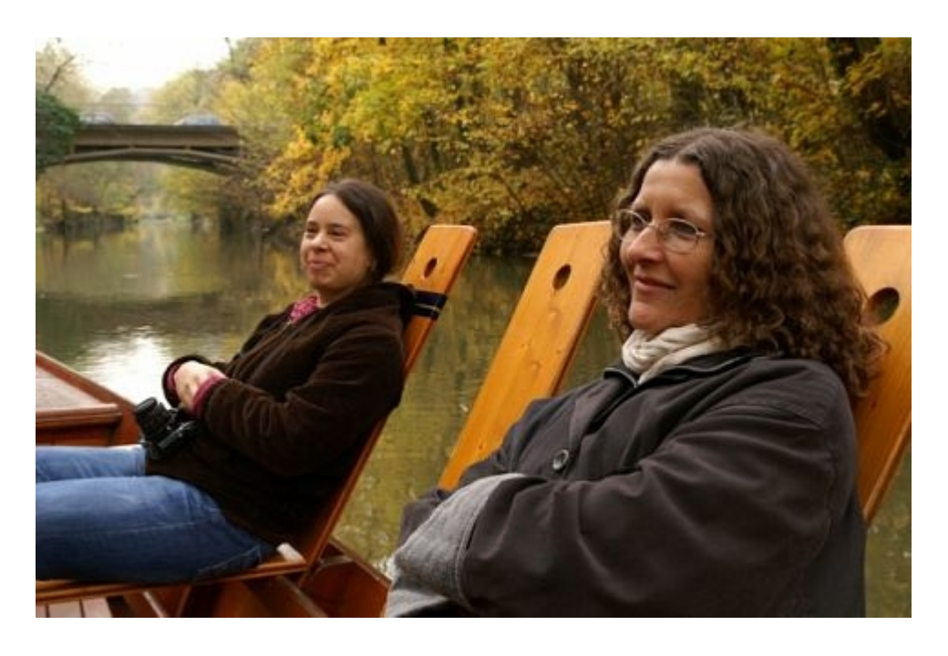
.... and nothing compares for that aim to a punt-ride on the Neckar...