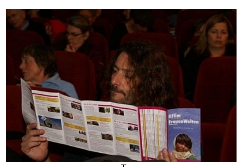
T he guests were delighted to use the opportunity...