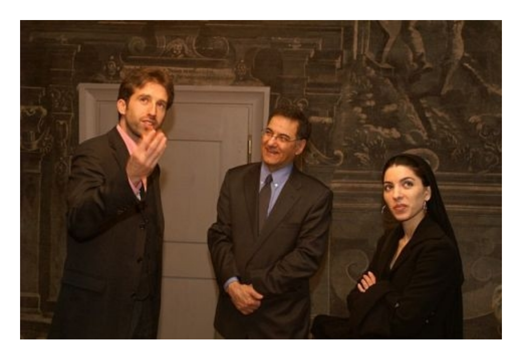
... in the name of the city of Tuebingen inside the old town hall....