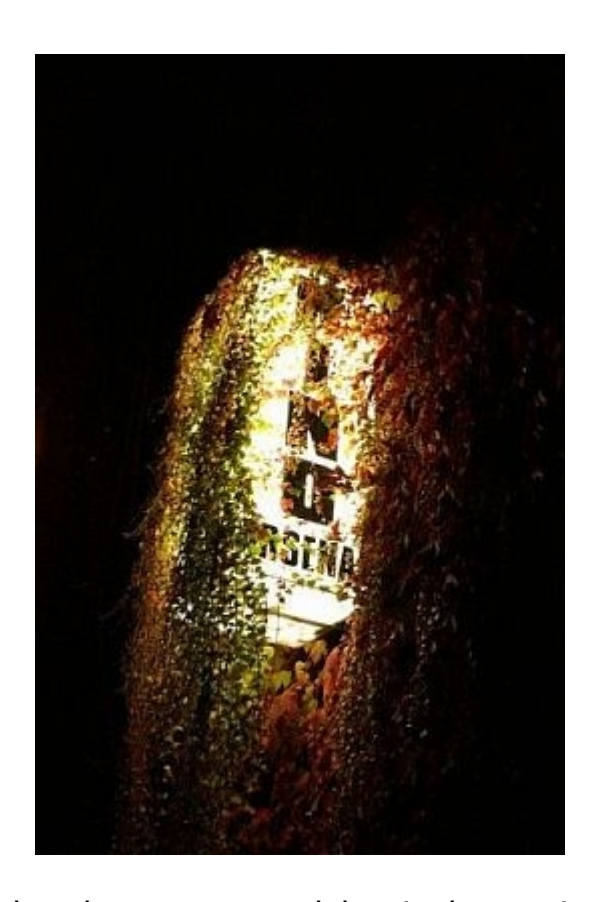
The most likely route though our guests took late in the evening was back towards the Arsenal bar...