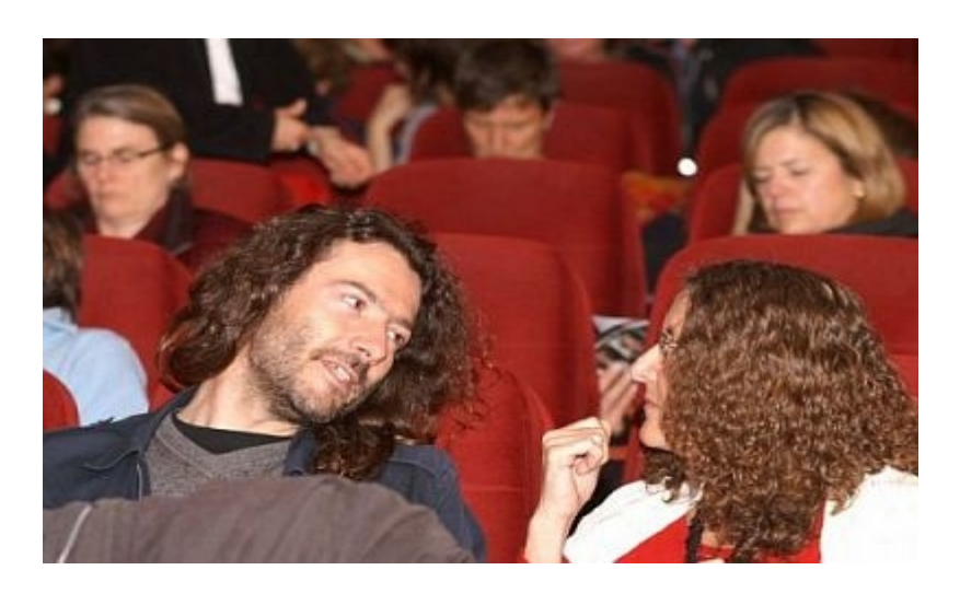
... to see other movies at Women's Worlds.....