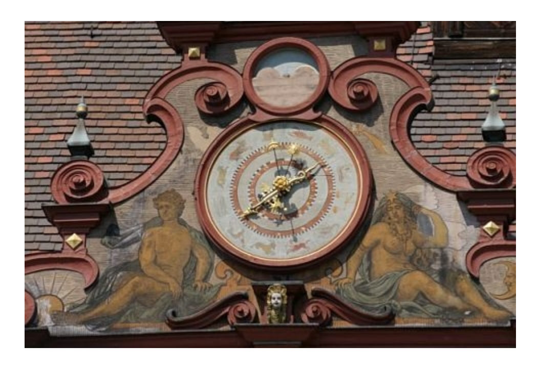
... whose dragon index has precisely calculated the solar and lunar eclipse of the last 500 years.