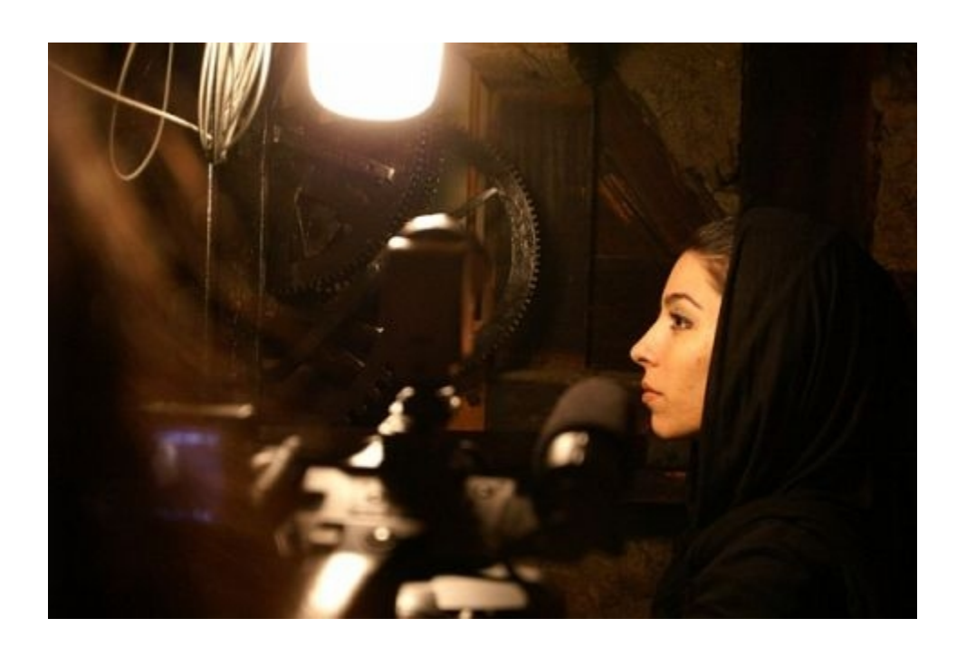
where she was able to have a look into the mysterious interior of the famous astronomical clock...