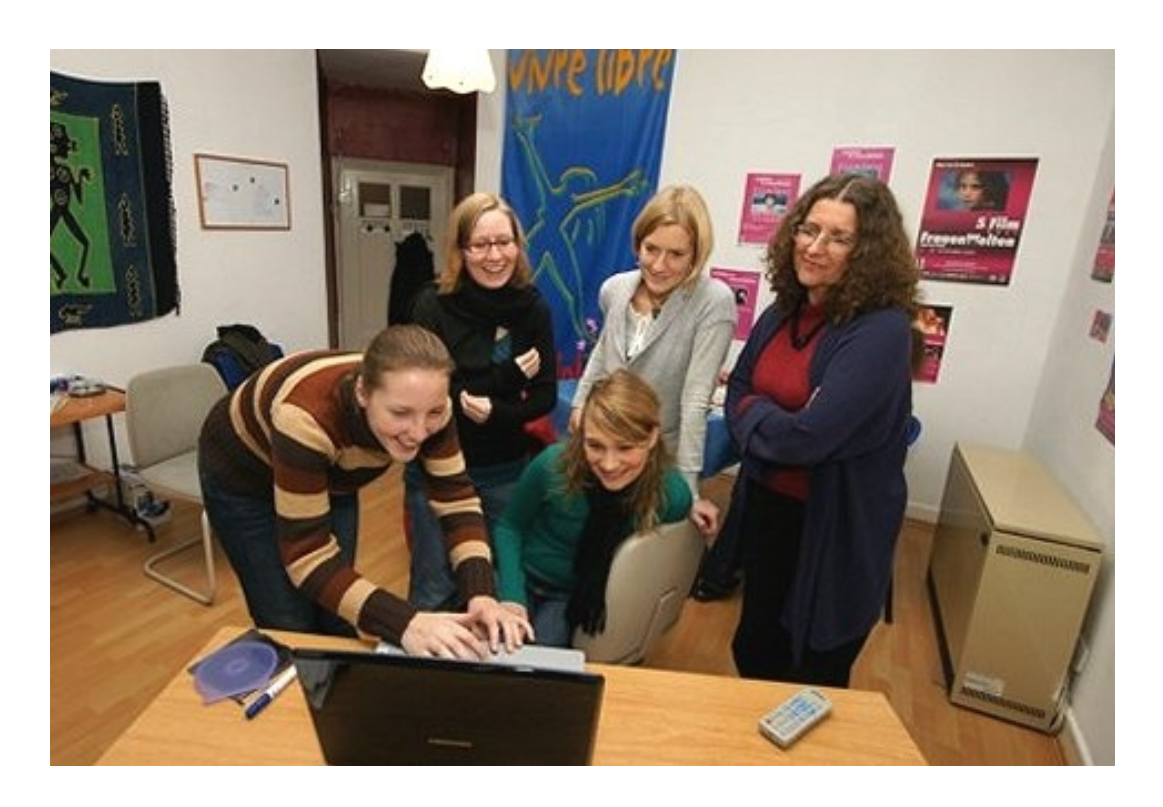
...to our generous and cozy Film Festival office...