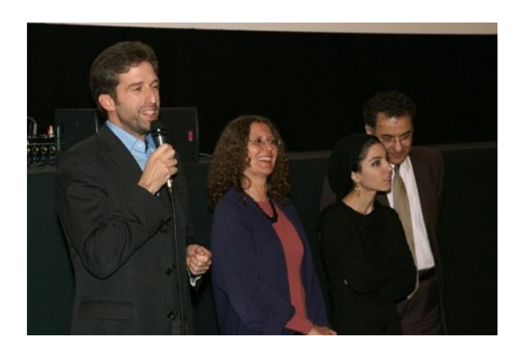
Mayor Boris Palmer also participated in the audience discussions on her impressive movies about violation of human rights on women. Samira Makhmalbaf claims not to condemn the people, but the social circumstances where these violations arise and occur.