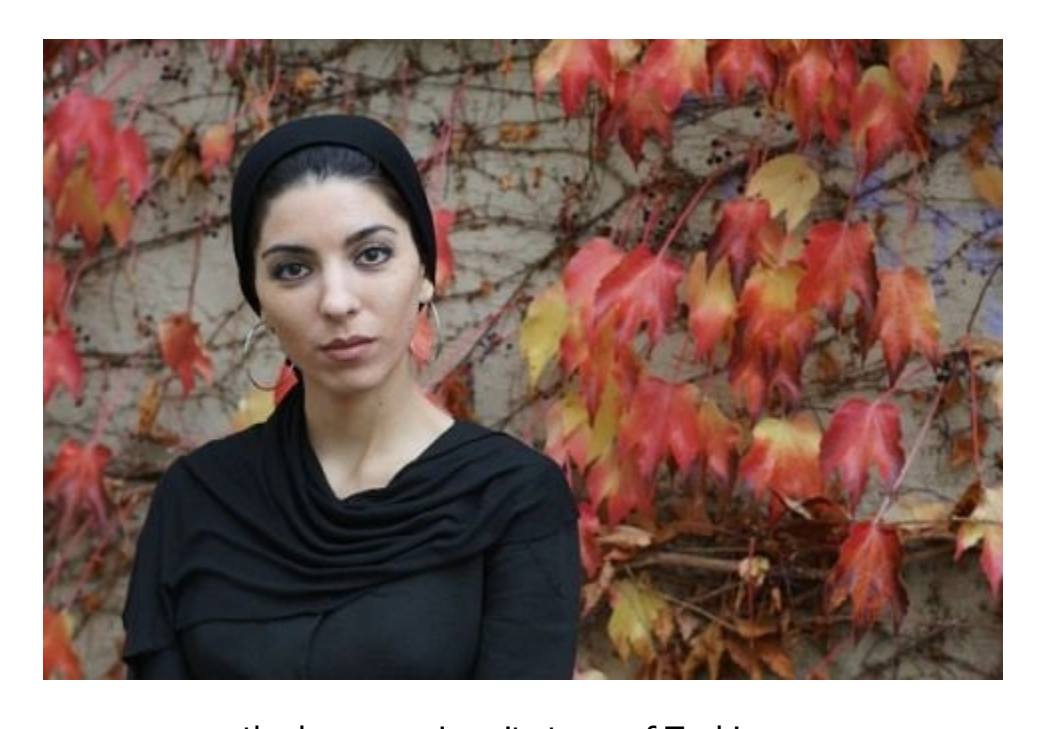
the homey university town of Tuebingen