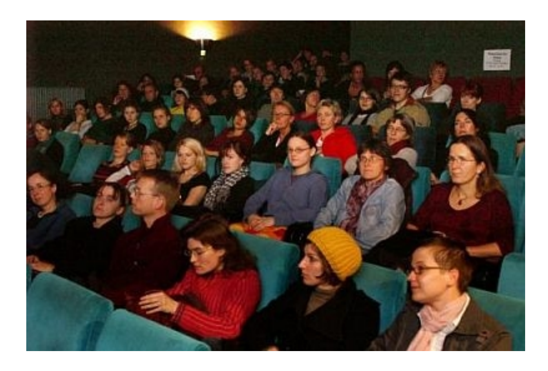
... in order to discuss these topics among them and with the audience